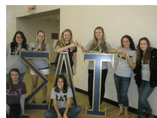
Sisters of Sigma Delta Tau at their first PCAA Walk.

2010 from 7 p.m. to 10 p.m. at the Hunt Union Ballroom. The entrance fee will be about $3. Anyone who is interested is more than wel-