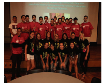
Kappa Sigma and Sigma Gamma Phi at Philanthropy Night.

experience and when the day is done, it makes us feel great knowing we brightened someone's day and helped feed a hungry family. The families that come are so thankful for the food they receive and love to sit down with us and have nice, enjoyable conversations. We have been volunteering here for a couple of semesters now and will continue doing so since we enjoy it so much.