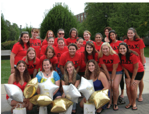
Pi Delta Chi Sorority with their new members at the Fall Bid Day Ceremony.

The Oneonta IGC will sponsor a fun run/walk on Sunday, October 24 at 9am. The walk will start at the Hunt Union and will follow a 2 mile trail through the campus. To register contact Alumni Affairs at www.oneontaalumni.com