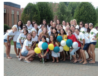
Sigma Gamma Phi with their new member class in the Quad on Bid Day.

and find out more specific information about each chapter. Also, at Sorority Preference Parties and Fraternity Informationals, potential new members attended the event of the organization they were most interested in joining, in an effort to make their final decision about which organization they would like a bid from. Attendance at many of this semester's events was outstanding. Events such as the Greek Fiesta and Philanthropy Night filled the Ballroom in Hunt Union. On Friday, September 3rd, 58 new members received Bids from recognized organizations at the Bid Day Ceremony. After completing their pledge process, these new members will join our Greek community, which currently consists of about 200 students. I am pleased to say that this semester's recruitment week was extremely successful and enjoyable for all students involved.