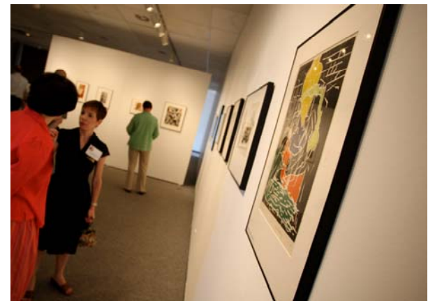
Martin-Mullin Art Gallery