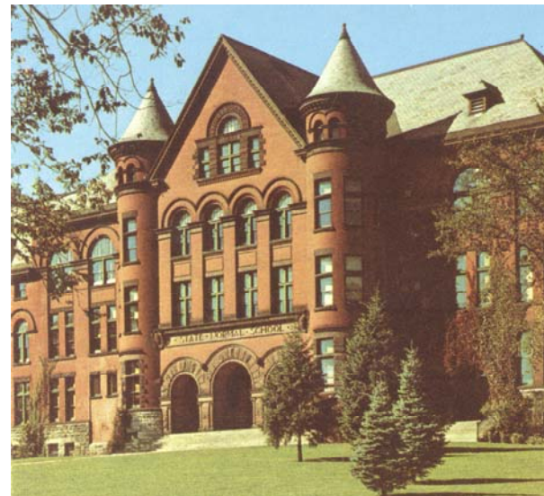
Old Main, the face of and primary facility of the College for the first half of the 20th century.

This year marks the 120 th anniversary of the founding of SUNY Oneonta in 1889. In the years since its establishment, the College has progressed to meet the changing needs of its students, New York State and the nation. The strong commitment and philanthropic support of Oneonta's faculty, staff, alumni and greater College community have enabled the College's academic reputation and scholarship opportunities for students to thrive and grow. As a result of these charitable investments, SUNY Oneonta has gained national recognition as a top-tier college and is considered among the best values in public higher education nationwide.