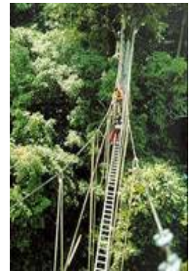
Clockwise: Top Left-- Cape Coast Castle, Cape Coast Beach, Fante Women, Kakum Forest, UCC guest housing, Kwabeng school kids Nkrumah's tomb/Accra, Kokrobite beach/Accra.