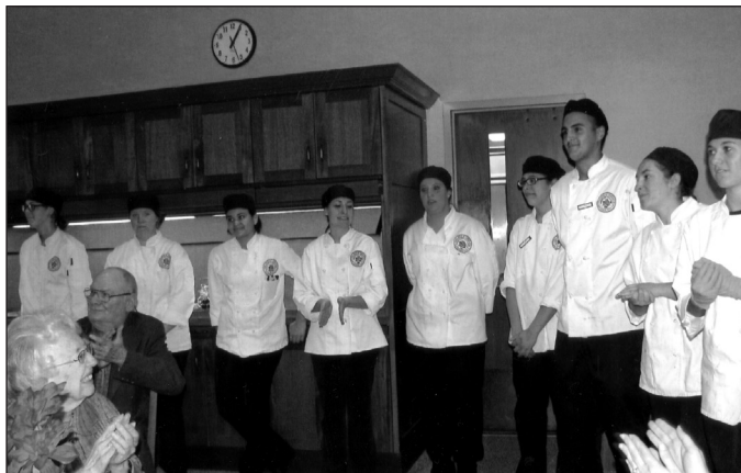
Student Chefs of Food 239